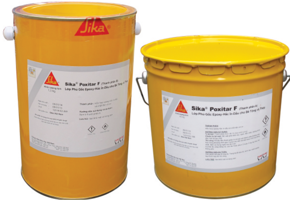
Product / sản phẩm: Sikagard 75 Epocem / Inertol Poxitar F