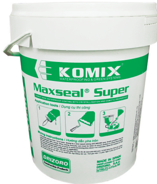
Product / sản phẩm: MAXSEAL SUPER