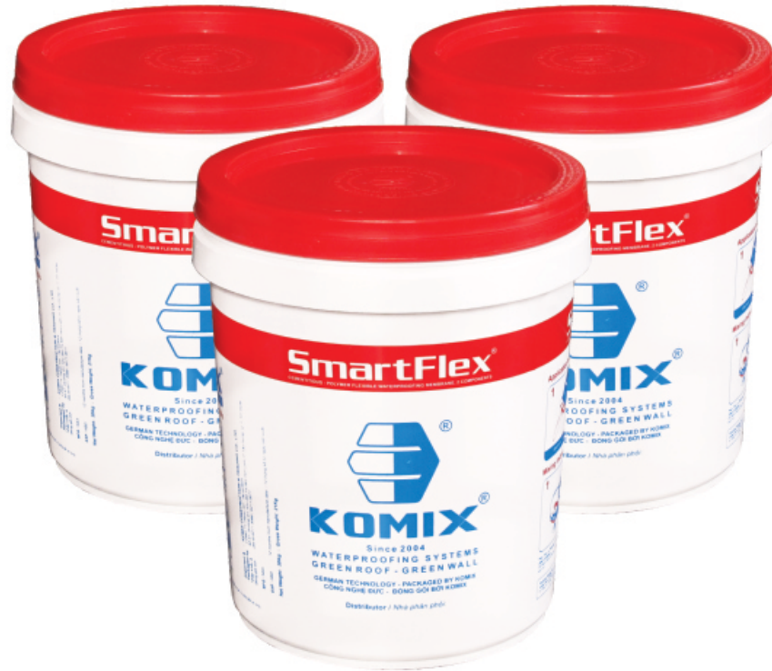
Product / sản phẩm: SMARTFLEX